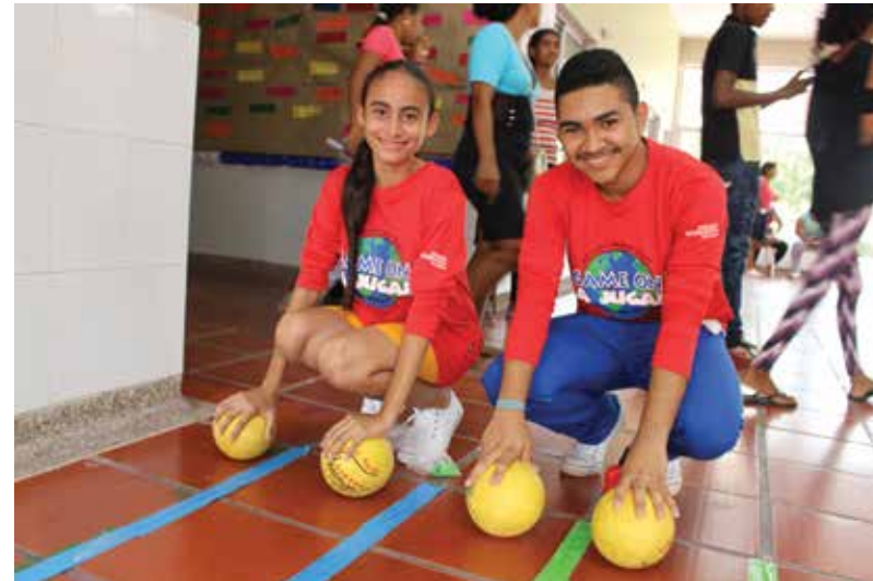
RIGHT: Using teamwork to solve a puzzle develops skills that are important for securing jobs that lift kids out of poverty.