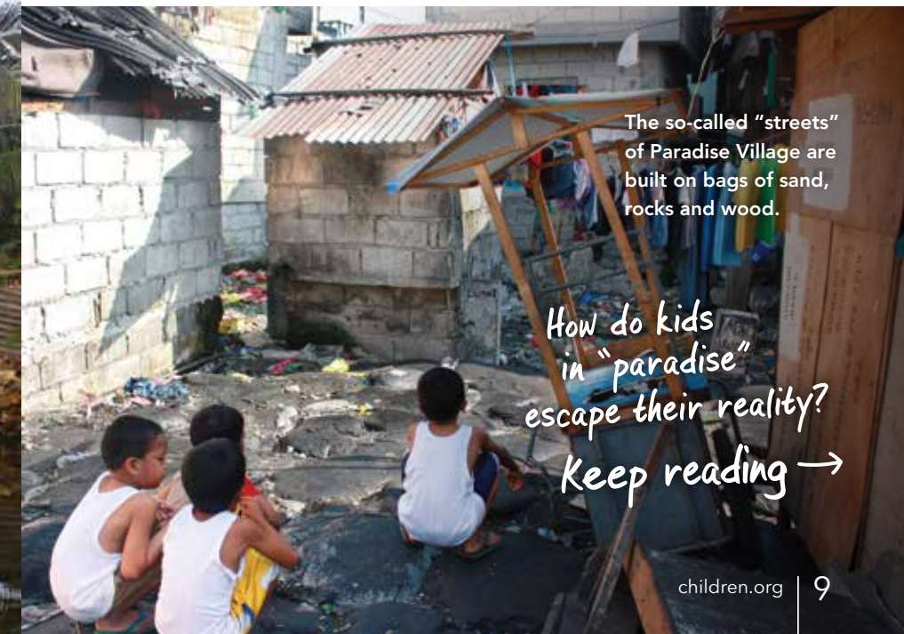
The so-called “streets” of Paradise Village are built on bags of sand, rocks and wood.

How do kids in “paradise” escape their reality? Keep reading →