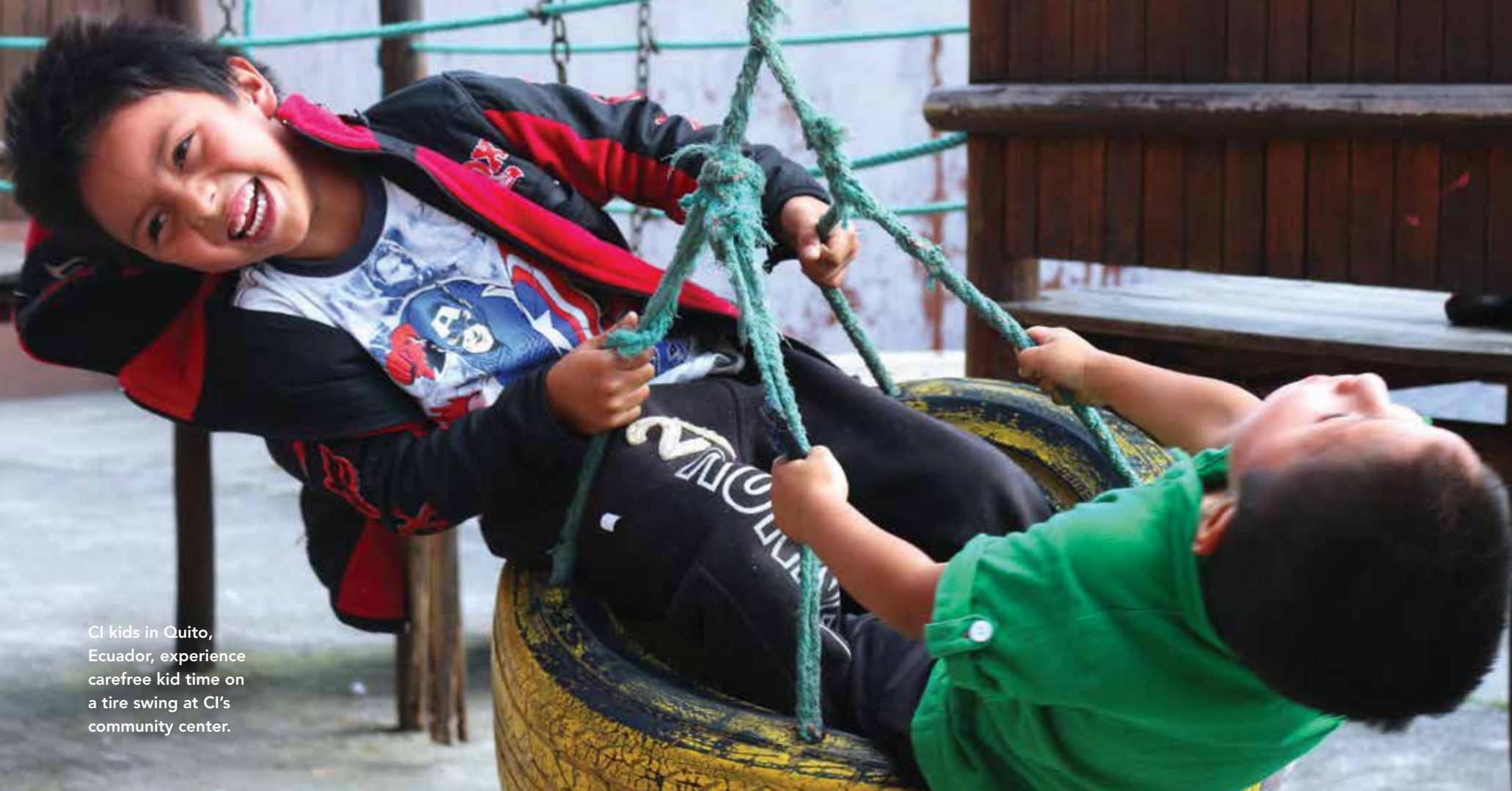
CI kids in Quito, Ecuador, experience carefree kid time on a tire swing at CI's community center.