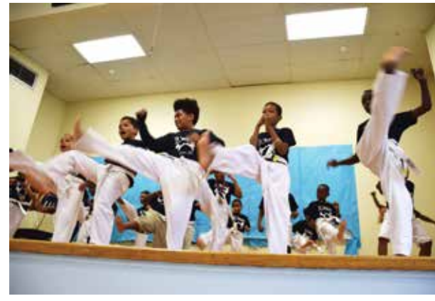
You're helping empower our Little Rock kids through a wide range of program offerings, including (clockwise from page 6) robotics, art, choir and martial arts.