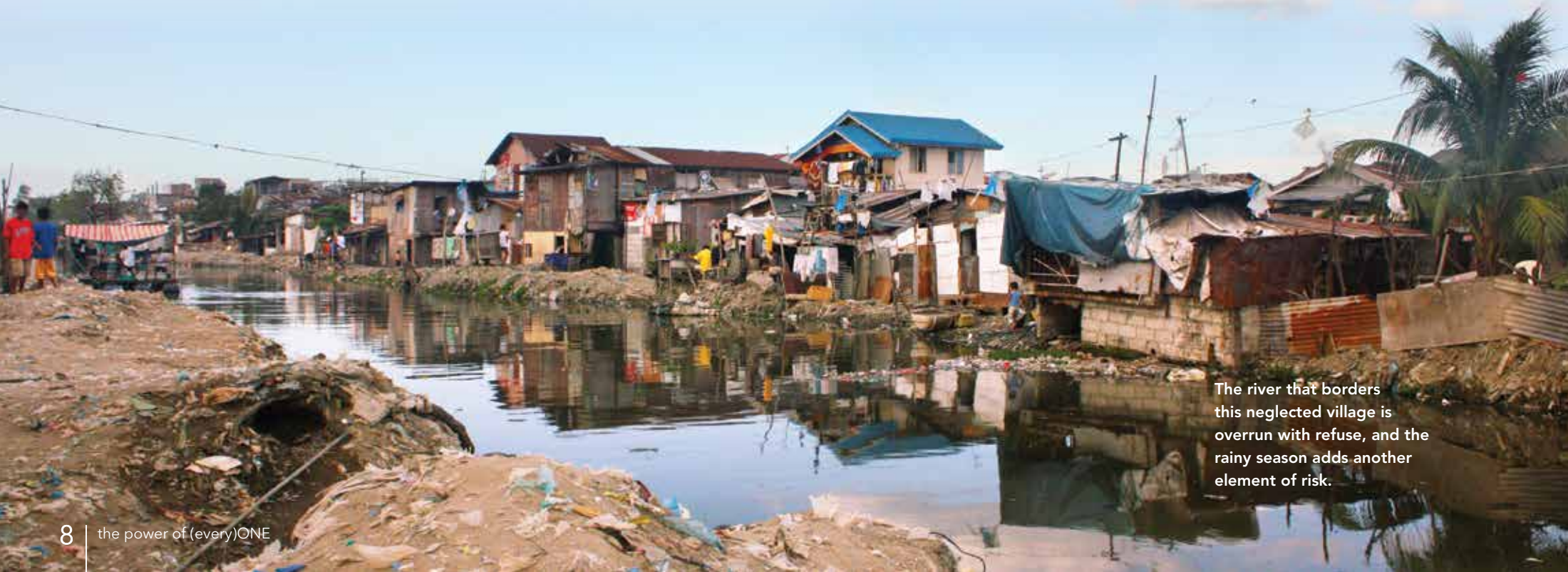
The river that borders this neglected village is overrun with refuse, and the rainy season adds another element of risk.