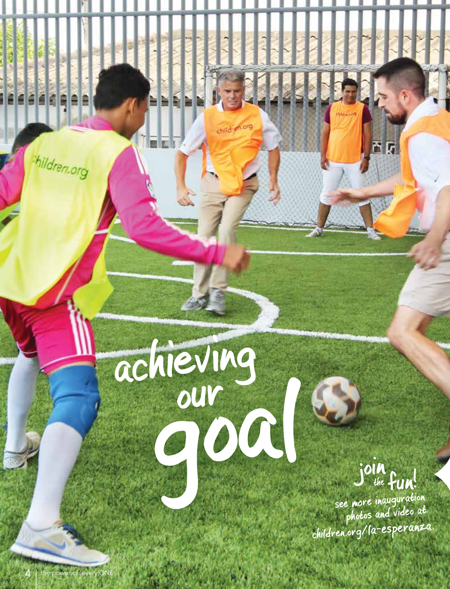
CI donors, staff and sponsored youth try out the sports court in our new youth center in Cartagena, Colombia.